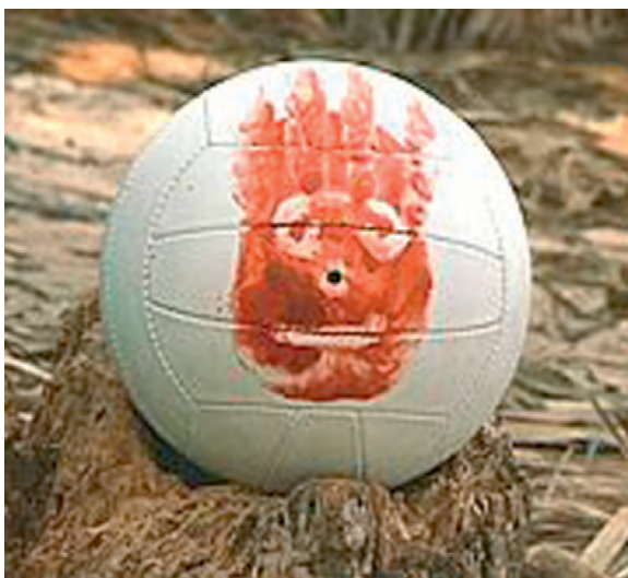
TRENDS in Cognitive Sciences

Social motivation thus appears to function like other basic homeostatic systems: relative deprivation gives rise to negative feelings that signal to the individual that her needs are not met, and a sophisticated psychological machinery is then triggered in an attempt to restore balance in the system (by increasing orientating, seeking, and maintaining behaviors).